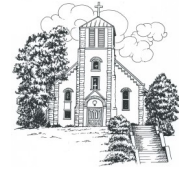
St. John the Baptist, Miltonsburg founded 1841

Parishes of the Roman Catholic Diocese of Steubenville