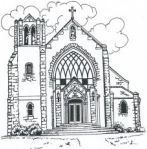
St. Sylvester, Woodsfield founded 1866