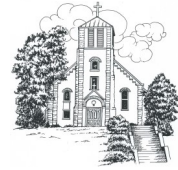
St. John the Baptist, Miltonsburg founded 1841

Parishes of the Roman Catholic Diocese of Steubenville