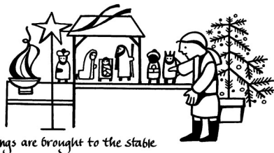
The Kings are brought to the stable

Arise! Shine, for your light has come, the glory of the Lord has dawned upon you. (Isaiah 60:1)